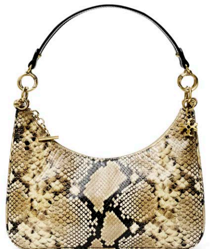
151 Mercer Hobo and 151 Mercer Crescent