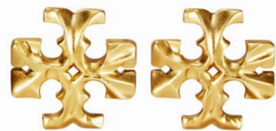
Snake Chain Necklace and Kira Stud Earring