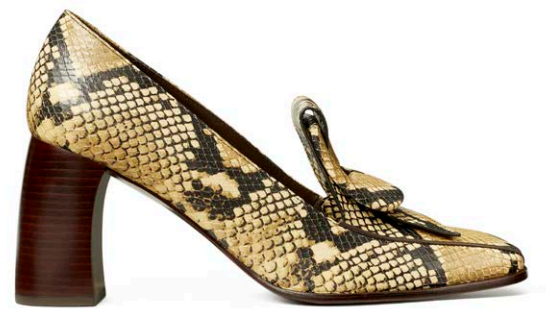
Curved-Heel Buckle Loafer