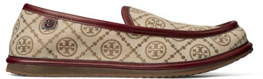
T Monogram Duffel and Toggle Glove and Buddy T Monogram Loafer