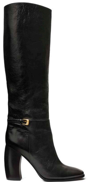
Curved-Heel Buckle Boot