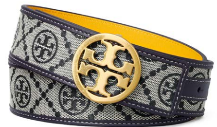
T Monogram Camera Bag and Belt