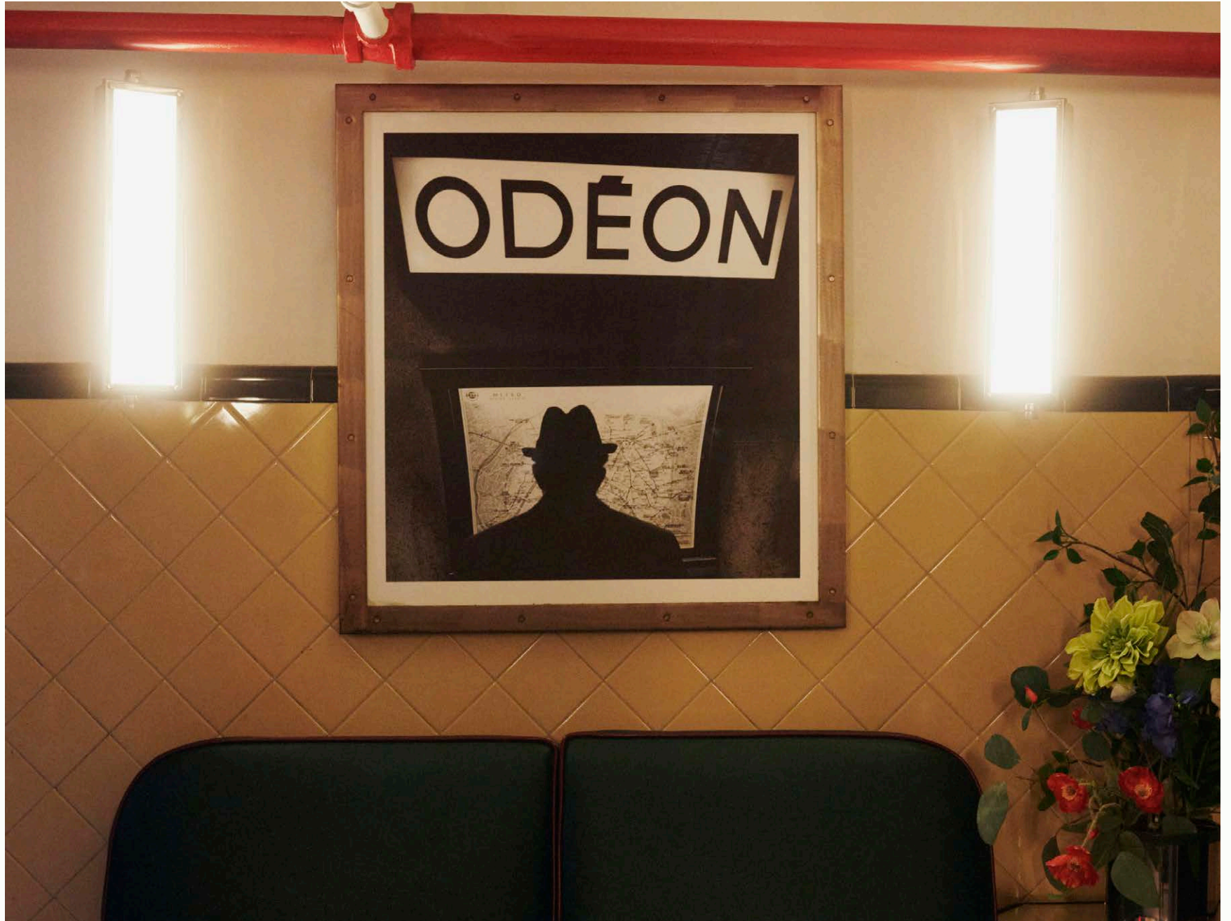
The Fall/Winter 2021 collection was photographed at the Odeon, a New York institution.