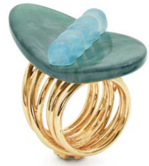
Button Necklace and Rings