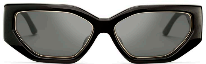
Geometric Kira Sunglasses