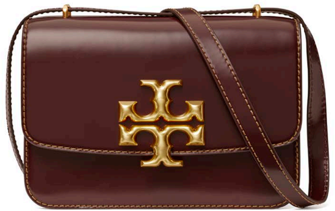
Eleanor Small Shoulder Bag and Shoulder Bag