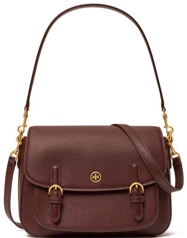
Robinson Messenger Bag