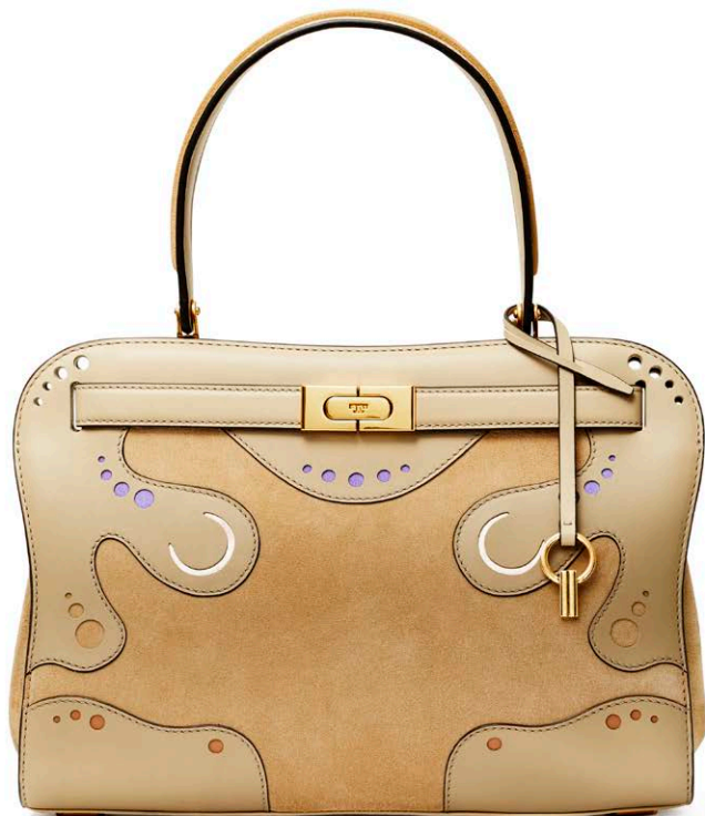
Lee Radziwill Western Bag