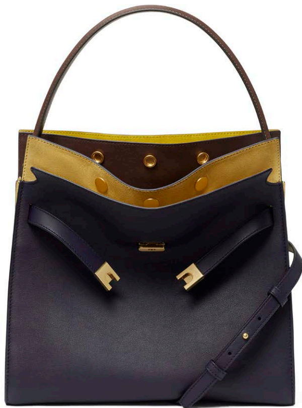
Lee Radziwill Double Bag